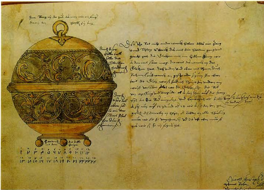
Vertical section of a spherical clock for the Grand Vizier Mehmed Sokollu Pasha. It was commissioned in 1576 from a master clockmaker in Augsburg by the Imperial Envoy to Istanbul, David Ungnad.