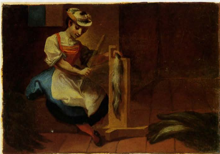
Figura 1ta: Ein altes Bild, welches die Arbeit der Webstühle, und ferdoll-waig zeigt, und die Webstühle, und die Webstühle, und die Webstühle zeigt. Robert Pirib.