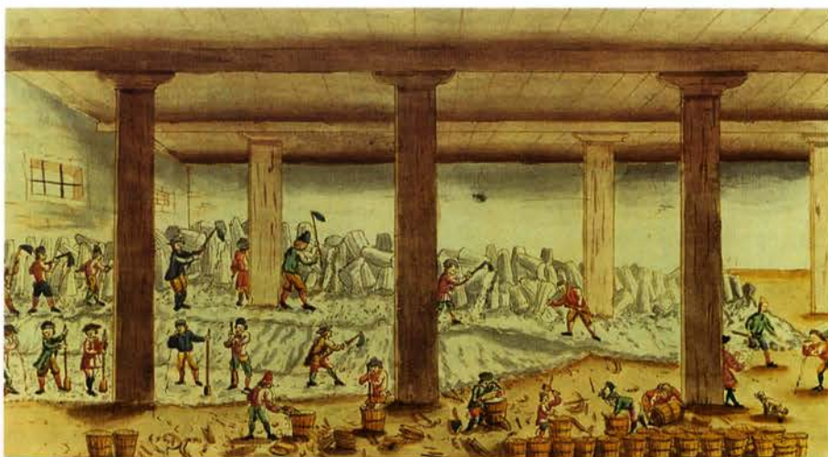
Salt production in the Salzkammergut: depiction from ca. 1656 of “Fuderhacken und Küferstossen”, showing how the blocks of salt were broken up and crushed and then put into wooden barrels for transportation.