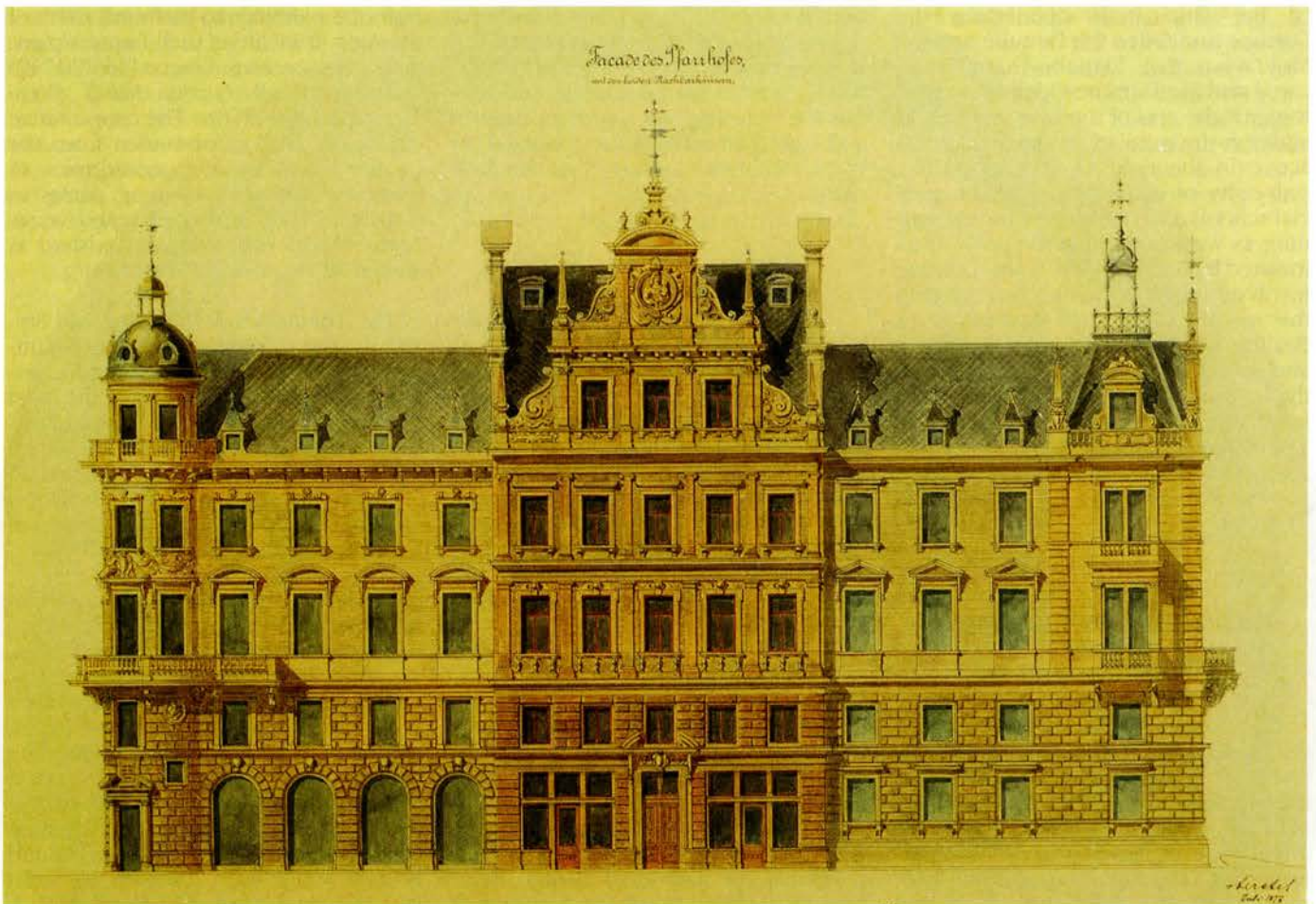
View of the facade of the presbytery of the Votivkirche in Vienna with the two neighbouring buildings, signed "Ferstel, July 1877".