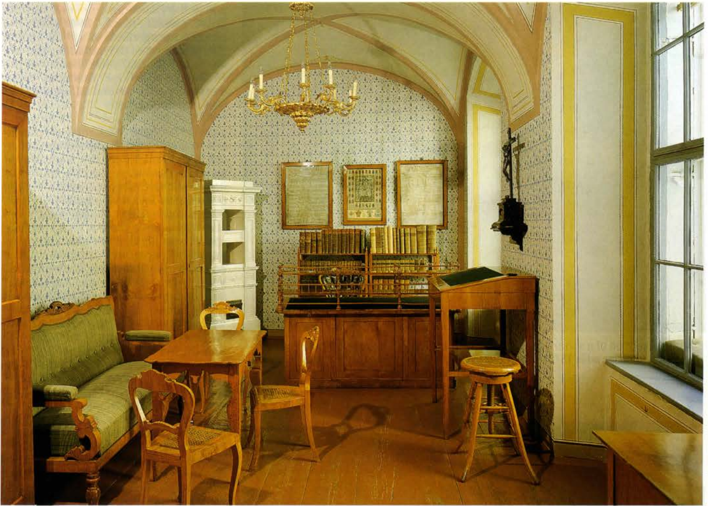
Franz Grillparzer's office with its original furniture and fittings.

exactly as it was in 1856, when the poet relinquished his post. Even the high desk on which he wrote his dramas is still there. In all probability, this office is the only genuine Biedermeier room in Vienna to be kept in its original form. It can be visited free of charge.