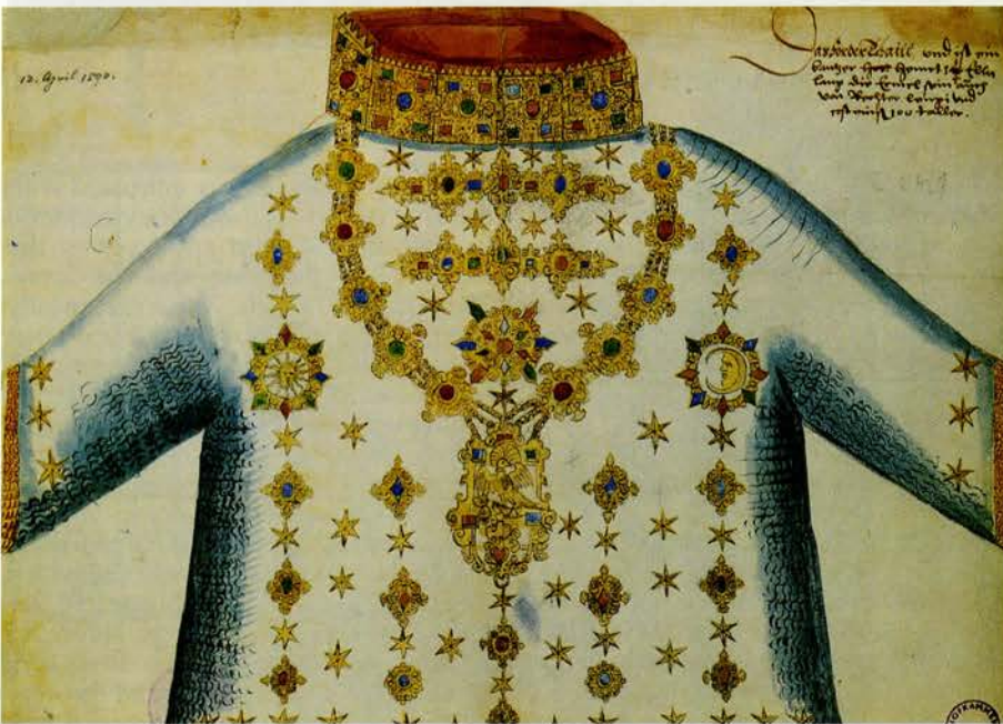
Sectional drawing of a hauberk with gilt appliqué work and encrusted with gems and stars. It was made in Nürnberg in 1590 as a special gift – actually as a form of tribute – from Emperor Rudolf II to Sinan Pasha.

within the Habsburg empire. It was the great revolution of 1848 and the ensuing reorganization of the entire administration of the monarchy that put an end to the 300 years' history of the Hofkammer , whose functions were then assigned to several different ministries and authorities.