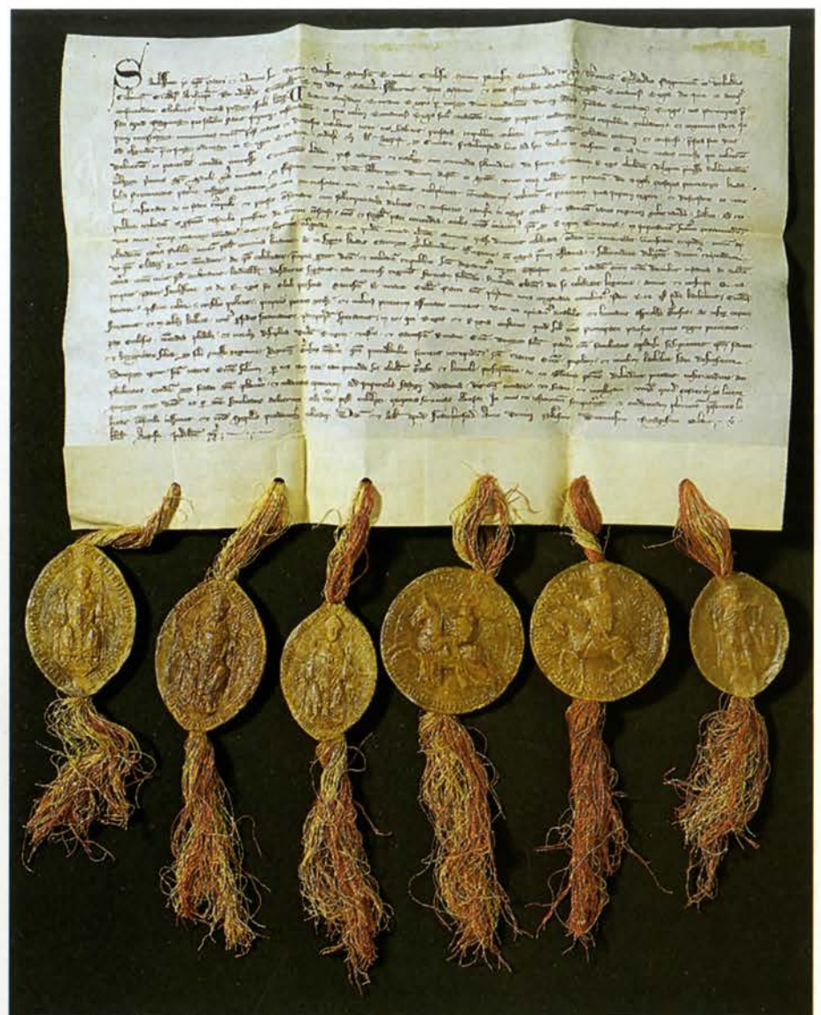
In a diploma of July 28, 1298, the Electors notify Pope Bonifatius VIII of the election of Duke Albrecht I of Austria as Roman King.

The events of 1859 and 1866/67 (defeats suffered by the imperial armies at Solferino and Königgrätz, loss of Lombardy and Venetia by the Habsburg monarchy) abruptly ended these reform plans and led to the hasty removal of archival material to temporary shelters and subsequently to the handing over of material (Venetia). These moves were badly organised as was the handing over of archives to regional institutes (archives of the regions) and to Belgium. Partly guided by selection principles tinged with personal interests, and all too often dominated by “opportunistic, unclear notions”, holdings which constituted integral units