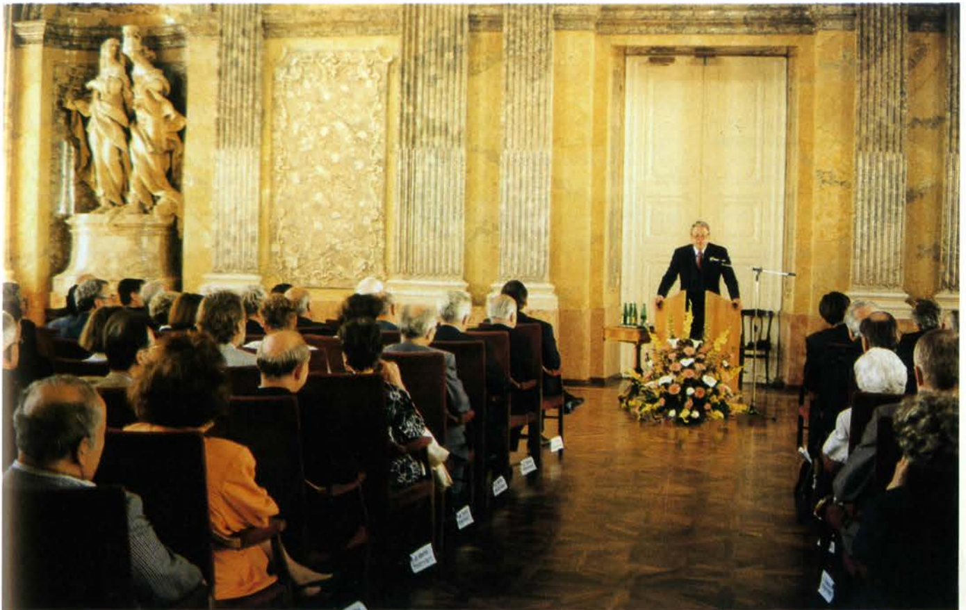
Ceremony in the main hall of the Academy of Sciences on the occasion of the 50th anniversary of the Österreichisches Staatsarchiv on May 31, 1995. Federal Chancellor Vranitzky giving a speech.