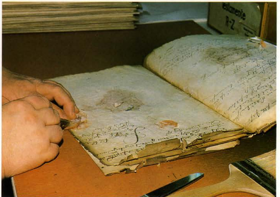
Work in the restoration room of the State Archives: records damaged by fire are being cleaned by hand, a seal is being removed from a document.